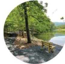
POND LOOP TRAIL