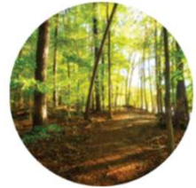
NATURAL SURFACE TRAILS