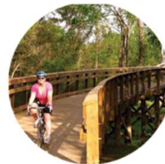
BRIDGE OVER STREAM