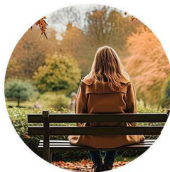
PLACES TO RELAX