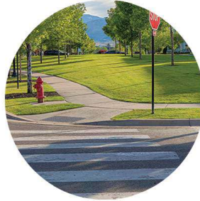
CONNECTIVITY & ACCESS