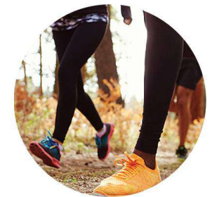
WALKING & RUNNING TRAILS